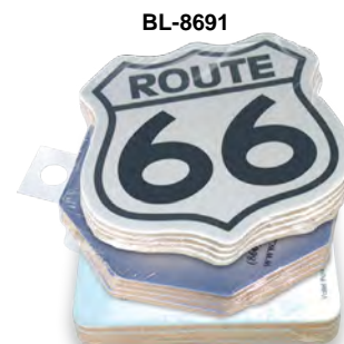
SHRINK WRAPPED IN SETS OF 4